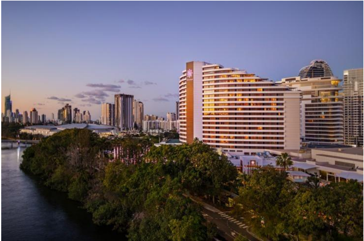
Gold Coast hinterland